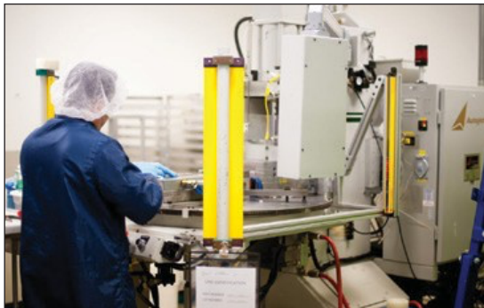
Figure 1. At Flexan’s vascular access center of excellence in Salt Lake City, an automated assembly line designed by the company improves manufacturing capacity for its customers.

To assist Medron (Flexan) in fine-tuning its quality systems, BAS sent people over to train the company’s employees, says Powers. “We sent environmental control people to help the company assess its use of filtration and to confirm its water and airborne particulate counts. We sent people from the quality department to make sure that the company had a training program equivalent to our own and to ensure that its documentation practices were consistent with ours.